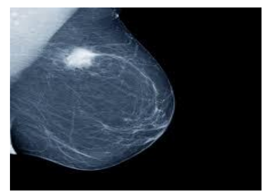
divided into two phases. First phase is feature selection and second phase is testing the selected features using the segmentation algorithm. The Fig 1: Typical image of a tumor.

detection accuracy of this method is good compared to other techniques that are available. The error rate is also less for this method.